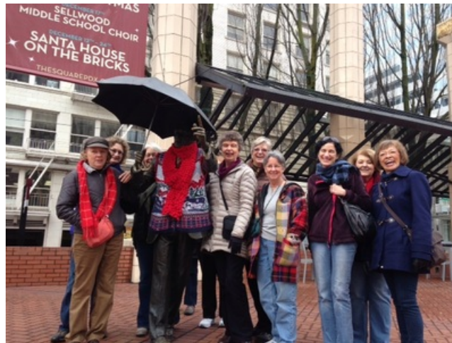
Wimpy Walkers enjoying an outing - pre-COVID, of course

You can find a printable schedule for the branch Study and Interest Groups in the text only Rose City Reporter . You can also check our website calendar for information and meeting dates at www.aauwpdx.org .